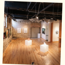
Water Street Studios