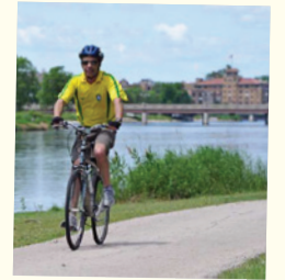
Fox River Trail

Finish the day off right with a cold one at Black and Gray Brewing Co. , featuring delicious craft brews in a range of signature styles, from local favorites to small batch rarities.