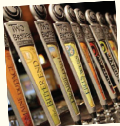
Two Brothers Roundhouse