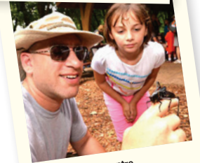
Red Oak Nature Centre