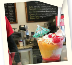
Van's Frozen Custard and Burgers