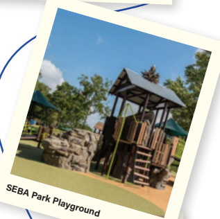
SEBA Park Playground