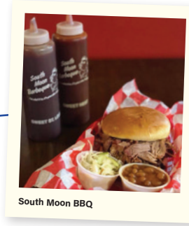
South Moon BBQ