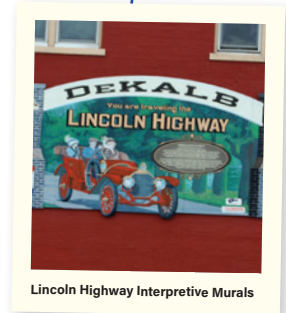
Lincoln Highway Interpretive Murals