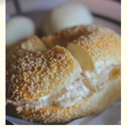
Barb City Bagels

Wake up and get energized for the car ride home with breakfast at Eggspress! Want to grab a souvenir before you head out? Stop at Blumen Gardens! This old warehouse is now a beautiful garden center filled with local goods and plenty of unique and exciting finds.