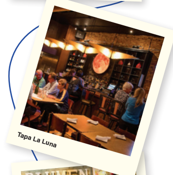
Tapa La Luna