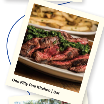
One Fifty One Kitchen | Bar