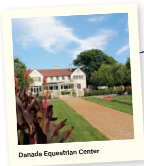
Danada Equestrian Center