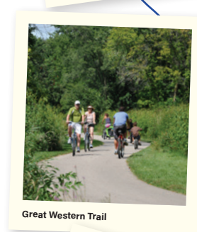
Great Western Trail