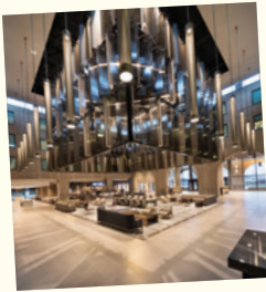
Hyatt Regency Schaumburg Chicago