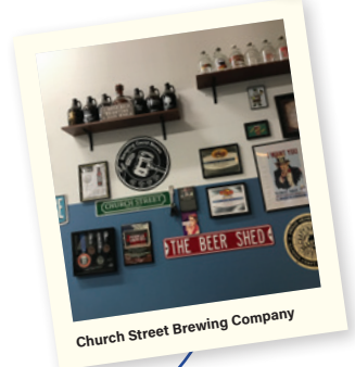
Church Street Brewing Company