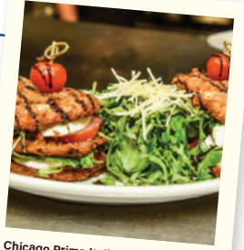
Chicago Prime Italian

Many attractions have reopened with limited capacity or different operating hours. Inquire with attractions ahead of time for up-to-date travel policies and health and safety information.