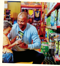
LEGOLAND Discovery Center