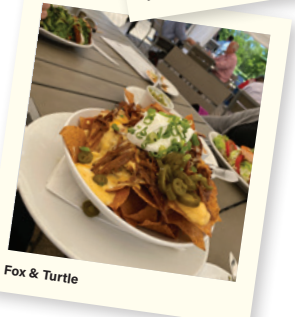
Fox & Turtle